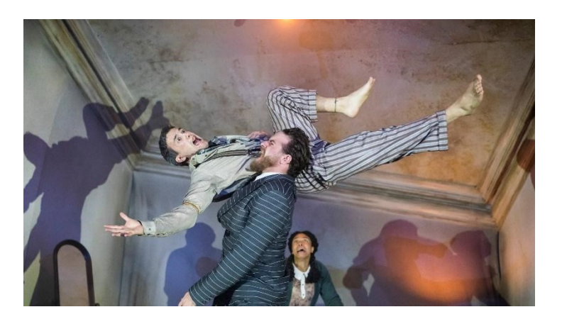
The performance highlights the potential for careers in the performing arts, proving an inspiration for many of our talented students who loved the show, and have plenty of opportunity to analyse and evaluate the performance as an informed audience.